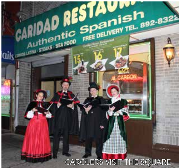
CAROLERS VISIT THE SQUARE