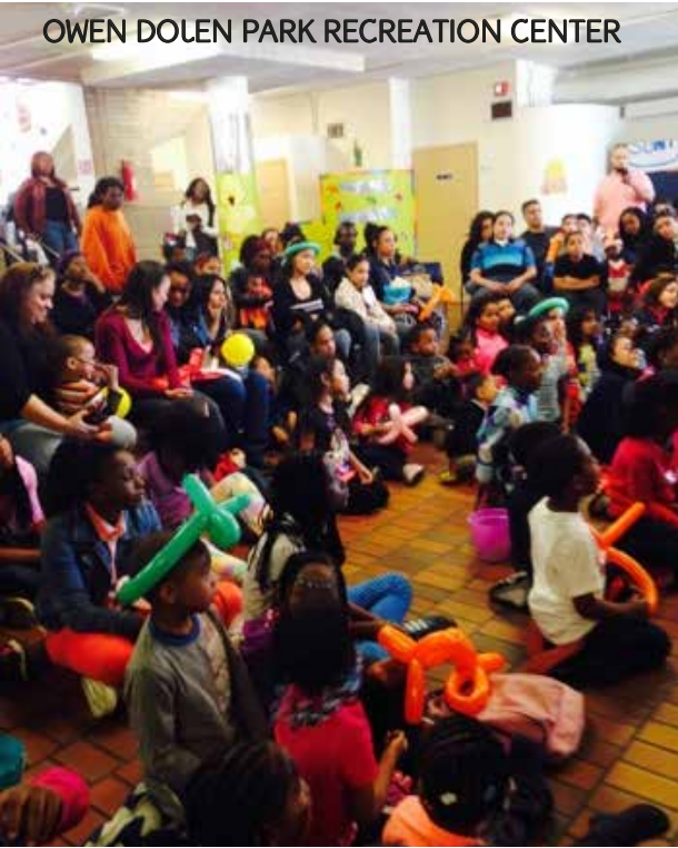
OWEN DOLEN PARK RECREATION CENTER