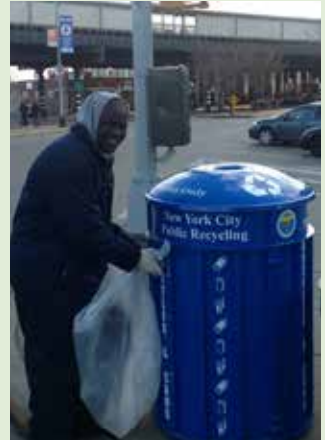
9000+ GARBAGE BAGS COLLECTED