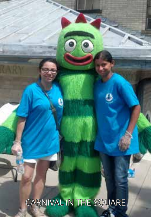
CARNIVAL IN THE SQUARE