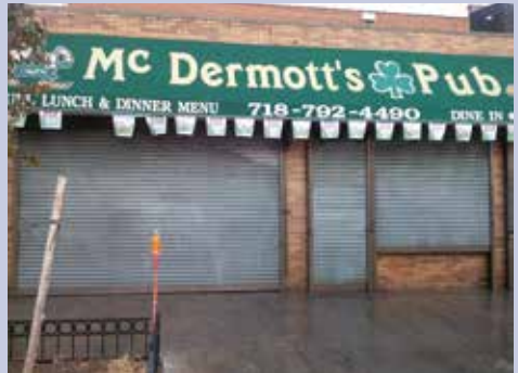
115+ GRAFFITI SITES CLEANED