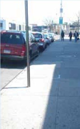
57 TREES PLANTED WITH GUARDS