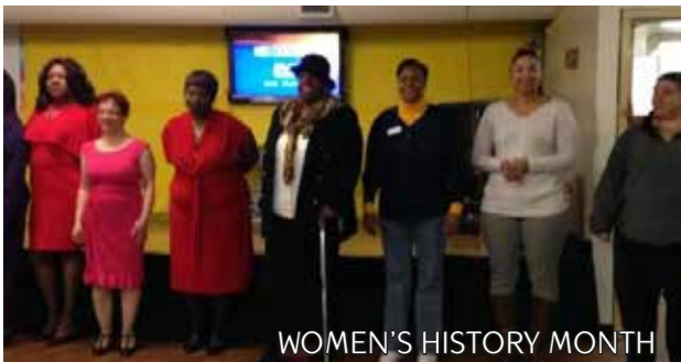
WOMEN'S HISTORY MONTH