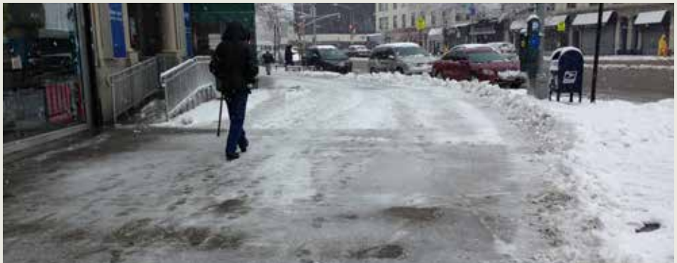
SPECIAL SNOW REMOVAL PROGRAM