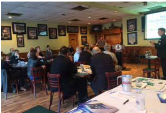
BROKER EVENT MAY 6, 2013