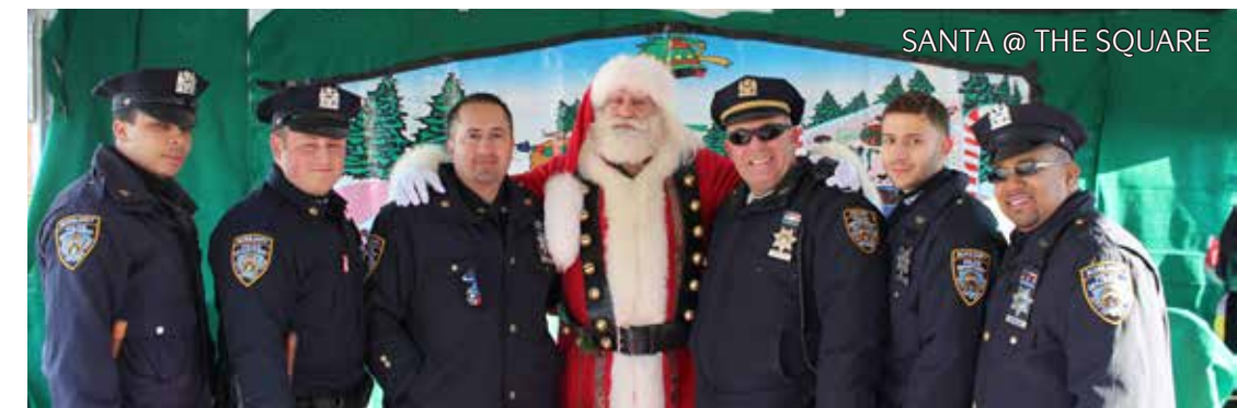
SANTA @ THE SQUARE